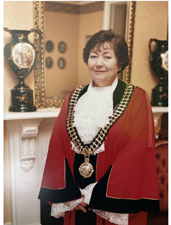
Photo 1 Laurel O'Toole - Mayoral Portrait.

During her two terms on Council, she was directly involved in many important projects and programs. She served on a number of committees for the 2000 Sydney Olympics which included representative to the Olympic Authority Events Committee (1997-2000), Strathfield Olympics Initiatives Committee (1998-2000) and Homebush Bay Local Government