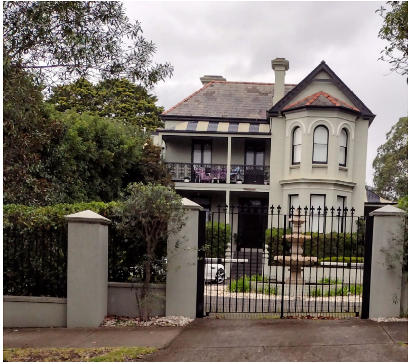
Photo 3 'Warragong' 30 Agnes Street Strathfield.

"Victorian Italianate style villa with a 'hipped and gabled roof of slate with terracotta ridging. A gabled wing is on the right side of the north (Agnes Street) elevation. The gabled wing has a faceted 2 storey bay with a hipped slate roof and the gable has elaborate timber fretwork barge boards. Three arched double hung windows are on each floor of the bay and are embellished with label moulds on the upper floor. A two storey verandah on the front of the house has an ogee form roof of corrugated steel and is supported on timber posts. Cast iron lace balustrading, brackets and valence embellish the verandah. French doors open to the verandahs on both floors. The house has two chimneys with rendered moulded corbels. Warragong is set well back from both streets. With its grounds, it is a prominent element in the local streetscape" [1] .